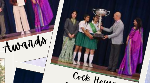
Cock House Sanojini House