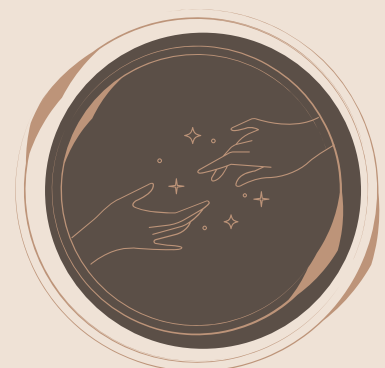
Manvi VI 17-04-2024